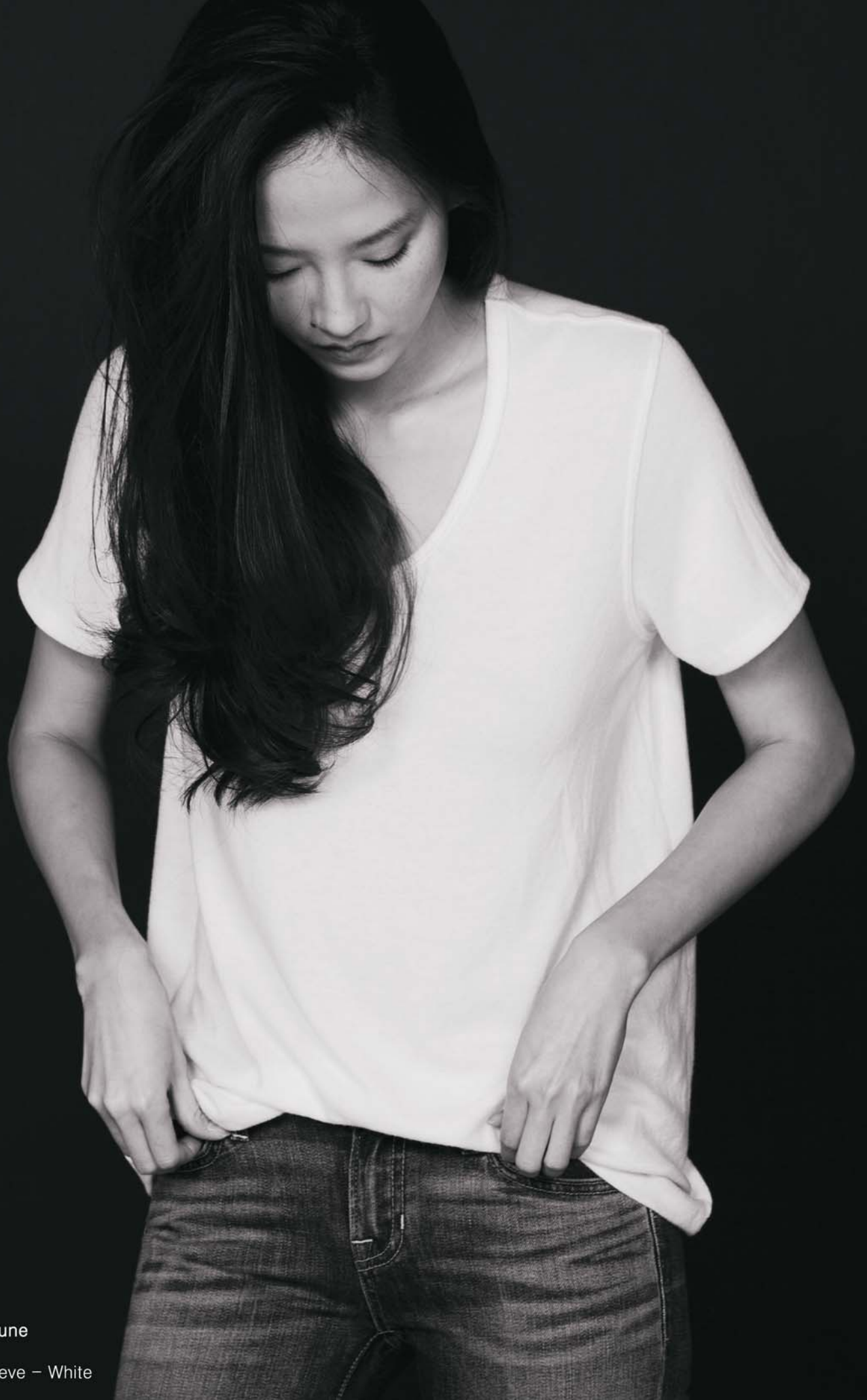
— Hye Park and Lune LW00S007 Saturn Short Sleeve - White