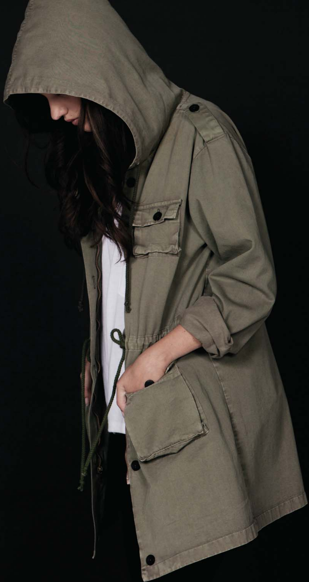
Hye Park and Lune LW07L012 Planet Military Jacket – Army Green